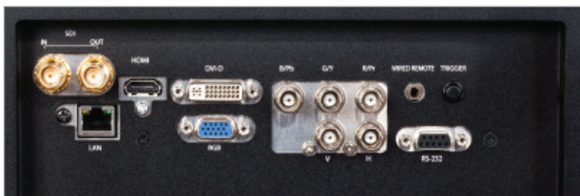
Includes a full complement of connections, including network control.

EIKI® is a registered trademark of EIKI International, Inc. Kensington® is a registered trademark of ACCO Brands Corporation.