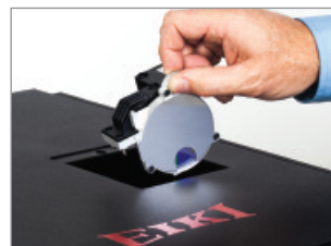
Easy access to color wheel.