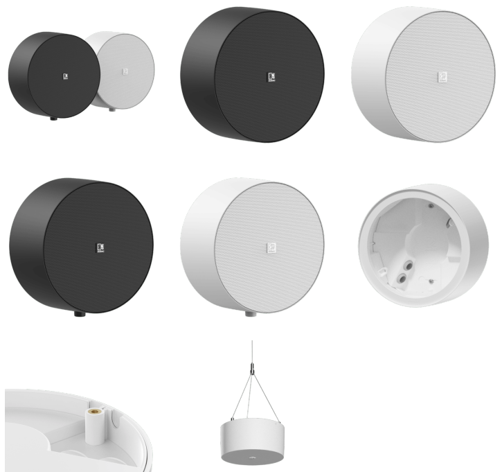
CSK100 - Optional suspension kit